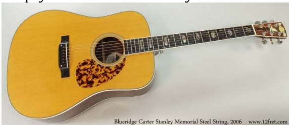
Bluebridge Carter Stanley Memorial Steel String, 2006 www.12fret.com